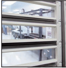
Nine inch high vision slats for increased visibility