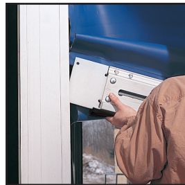
Easily resets, without the need for tools