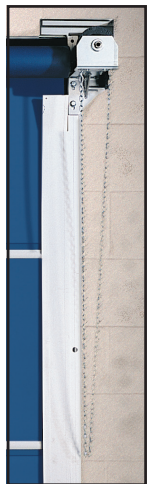
Manual Chain Hoist